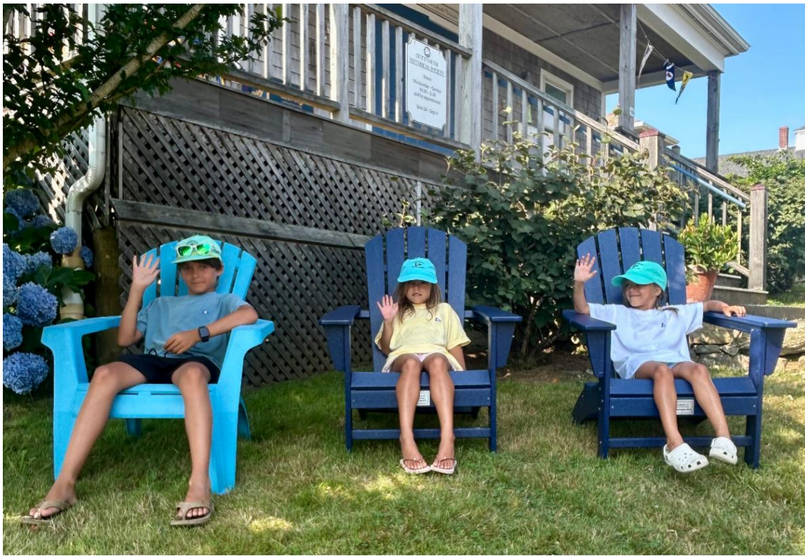
The McGuire Kids hanging out at the museum this past summer.