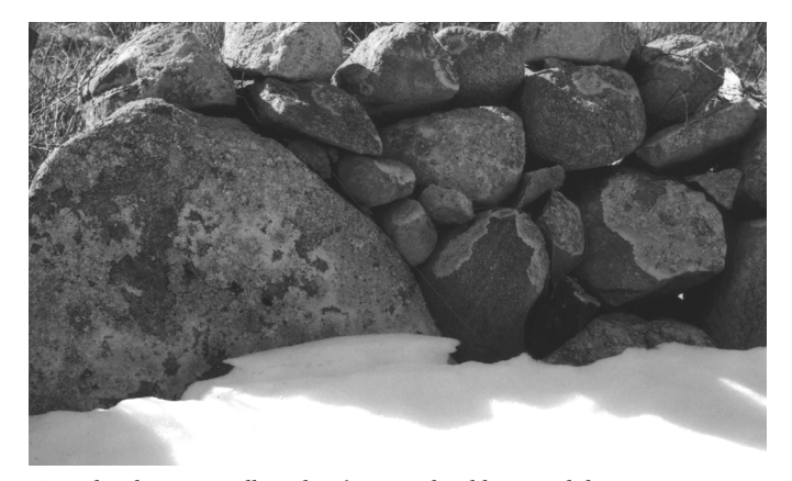
Cuttyhunk stone wall made of granite boulders, with late winter snow.

Trees gradually replaced tundra as the climate warmed. Bartholomew Gosnold's crew in 1602 described